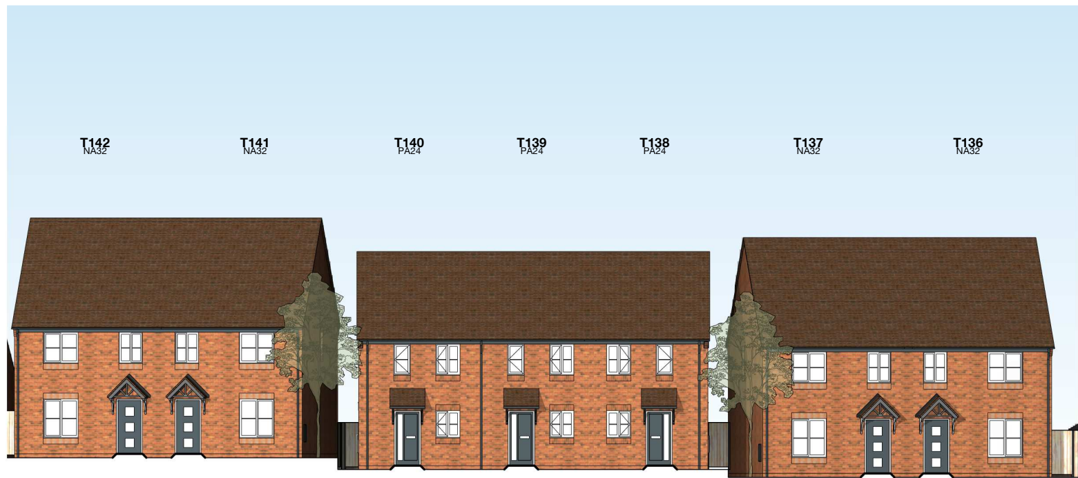
TW - Lane 01 1 : 200