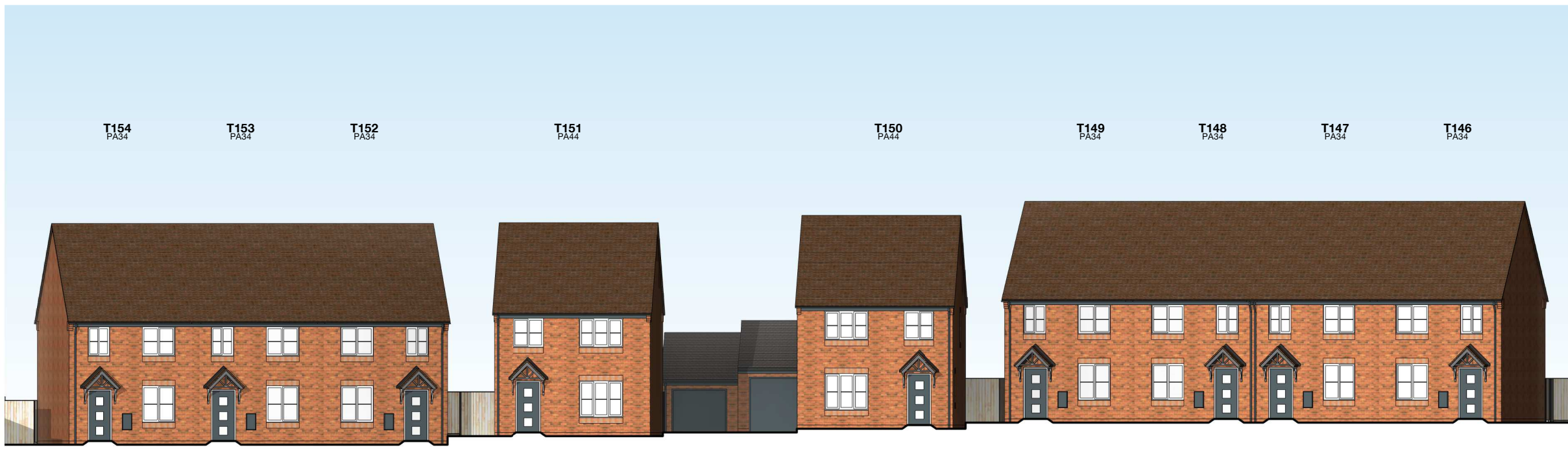
TW - Lane 02 1 : 200