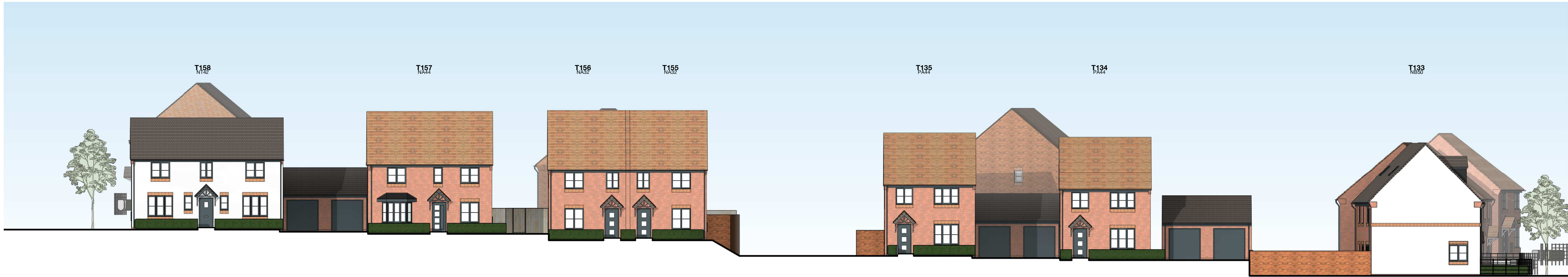
TW - Park Edge 01 1 : 200