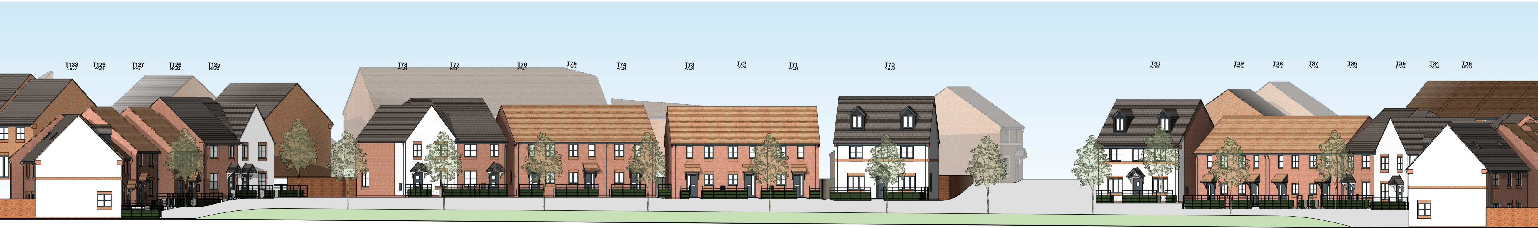
TW - Park Edge 02 1 : 200